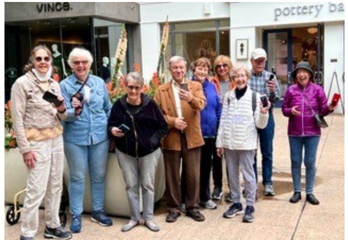
Photo Group at Stanford Center, May 2022