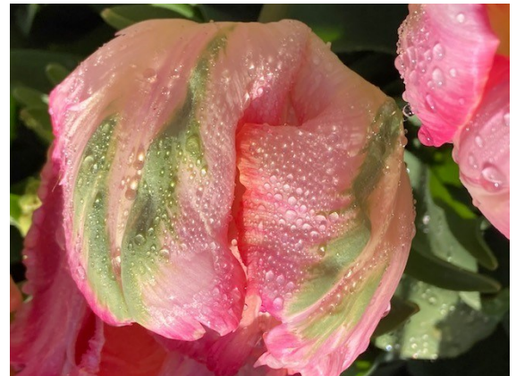
Flower