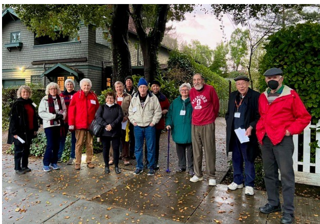
13 Village Walkers gathered at the start of their tour of Christmas Tree lane and the decorated homes nearby