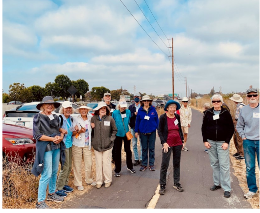
A happy crowd of Village Walkers, September 2021