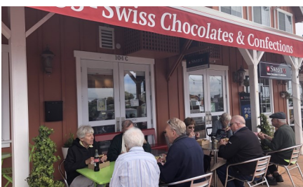
In Half Moon Bay, Villagers toured Ouroboros Aquaponic Farm and enjoyed lunch in town with a special stop at "Sweet 55" Swiss Chocolate shop