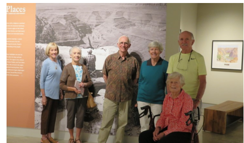
A hidden Palo Alto Gem, the Foster displays intricate water-color depictions of Tony Foster's nature excursions