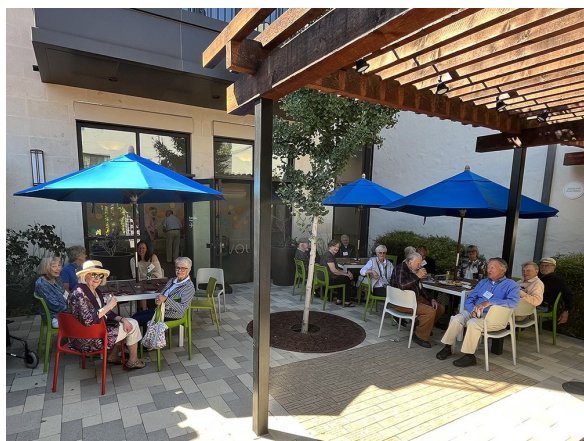
25 Villagers gathered for food, drink and conversation on the Village patio for our first outdoor Happy Hour Social of 2023!