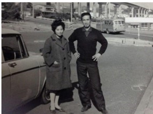
My parents in Japan, 1965

Many people have given me opportunities to learn and grow. This community has helped shape me into the person I am today, and I'm ready to give back. Life is fun! There are a lot of twists and turns that seem to be out of our control. I can't wait to hear your stories. Thank you for taking the time to read my introduction! I can't wait to get to know all of you more personally. See you soon!