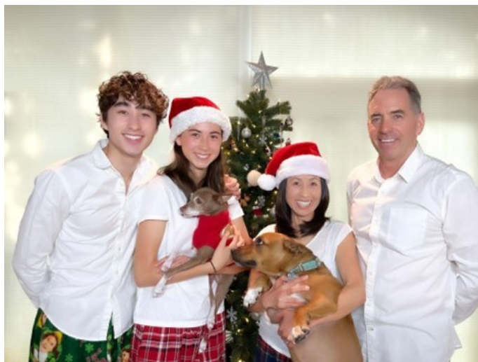
Family Christmas 2022