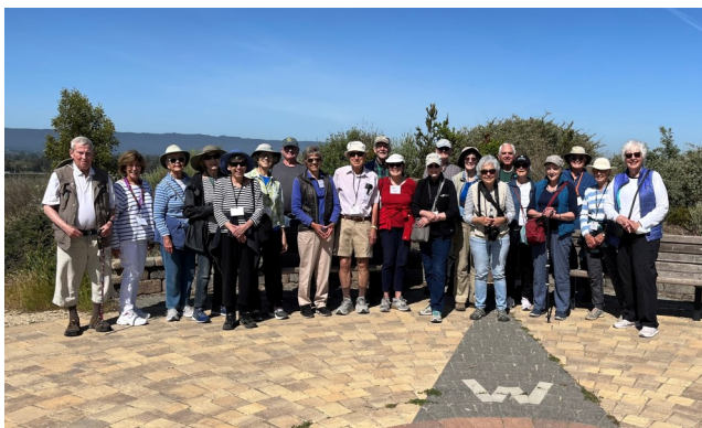
April 26, 2023: 21 of 24 walkers pictured at the summit of Palo Alto's Byxbee Park